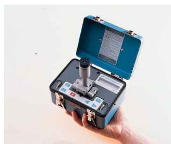
A technical data sheet for the FASE II Fusion Splicer is available on request