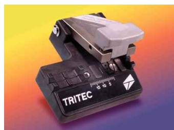
A technical data sheet for the TC A8 Optical Fibre Cleaver is available on request