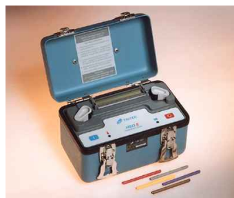
A technical data sheet for the HSO II Heatshrink Oven is available on request